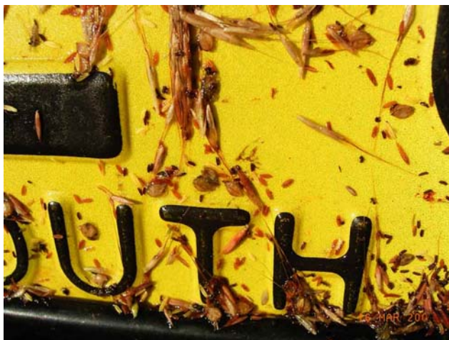
Photo (right) shows seed attached to the front number plate of a motor vehicle driven 50 metres along a track covered with (wet) Coolatai grass!

MORE INFORMATION? PLEASE CONTACT YOUR LOCAL WEEDS OFFICER: