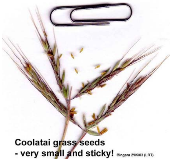
Coolatai grass seeds - very small and sticky! Bingara 29/5/03 (LRT)

Coolatai grass has an amazing capacity to spread. During its seeding phase, the plant produces thousands of tiny, sticky seeds which adhere readily to animals, farm machinery and motor vehicles.